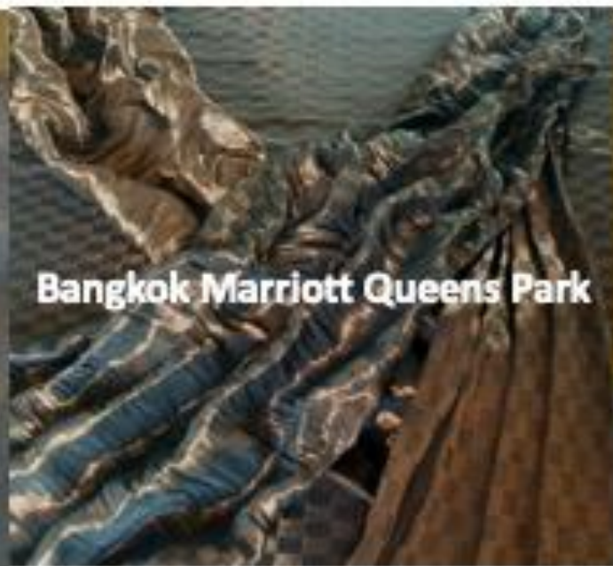
Bangkok Marriott Queens Park