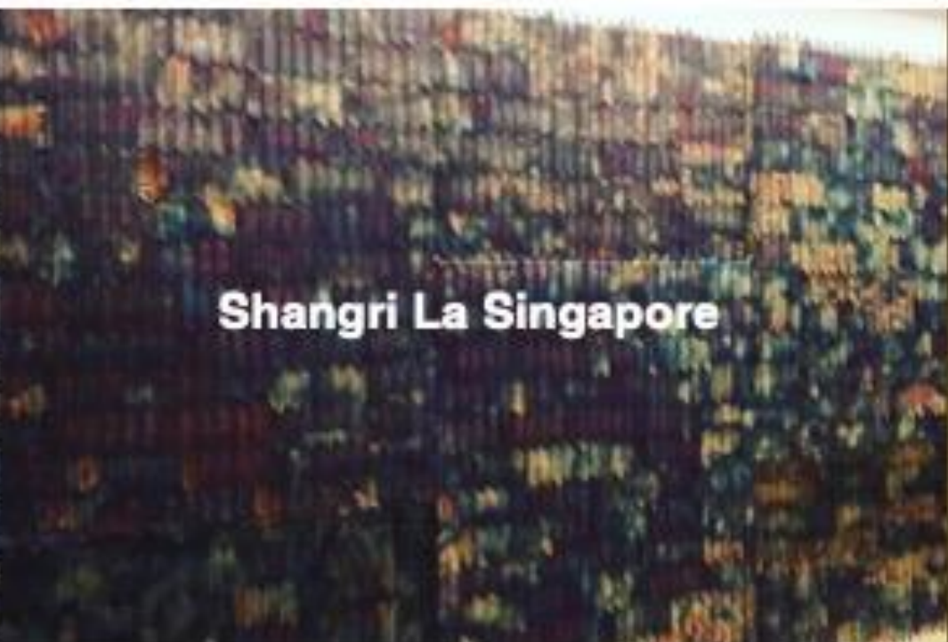
Shangri La Singapore