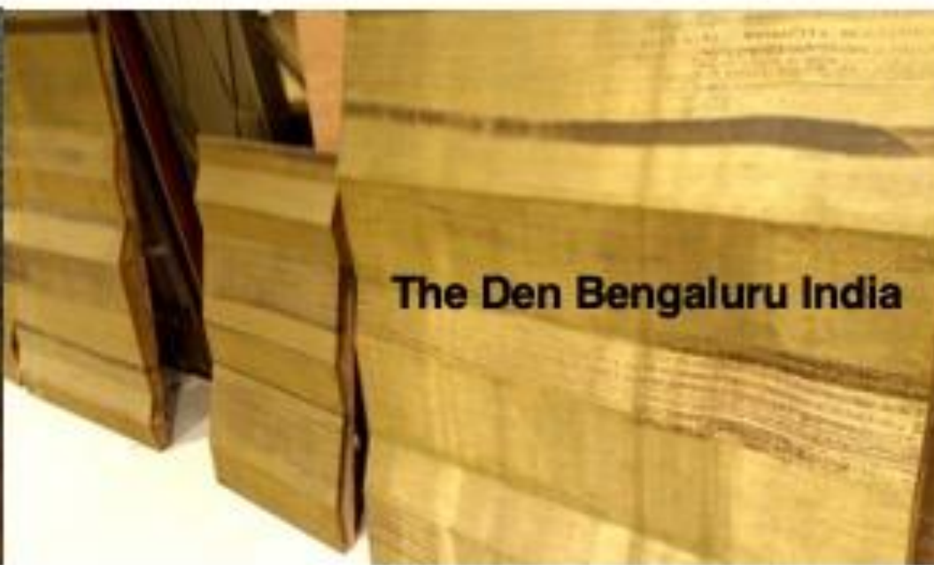
The Den Bengaluru India