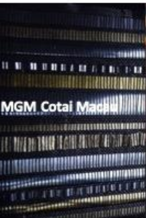
MGM Cotai Macau