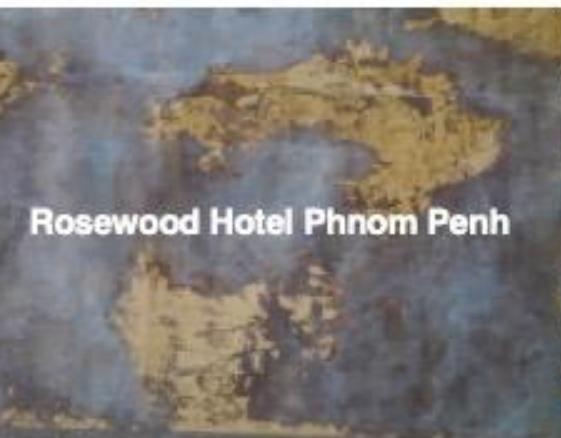
Rosewood Hotel Phnom Penh