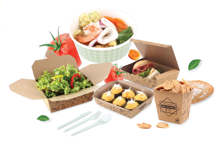
Bio-Eco's PBS, CPLA Takeaway Set