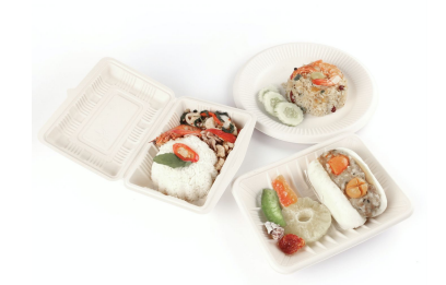
PLA + Starch