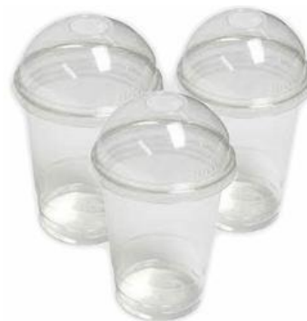
Cold Drink Cup