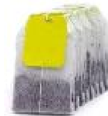
Non-woven Tea Bag