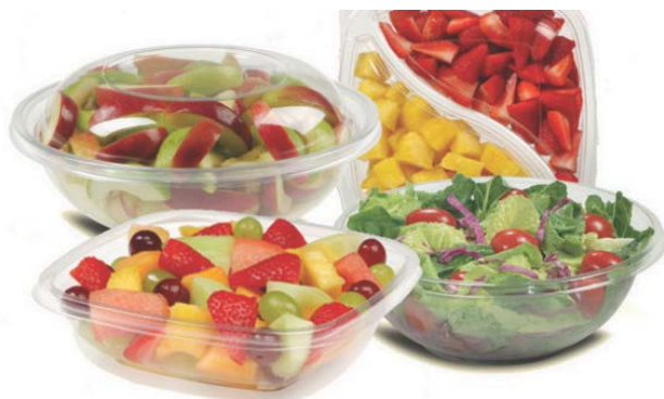
Rigid Food Packaging